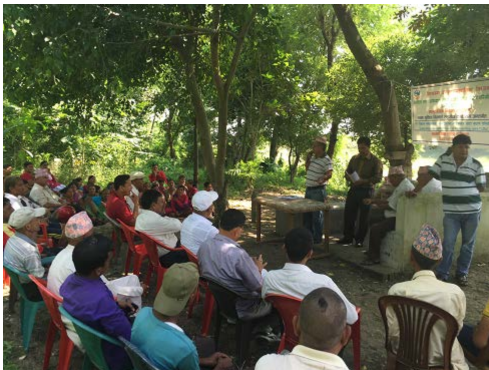
Figure 1. Social Audit in Bijayapur North in ward no 1, for Lane Improvement Program