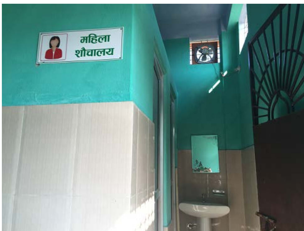
Figure 3. Internal Arrangement of Public Toilet