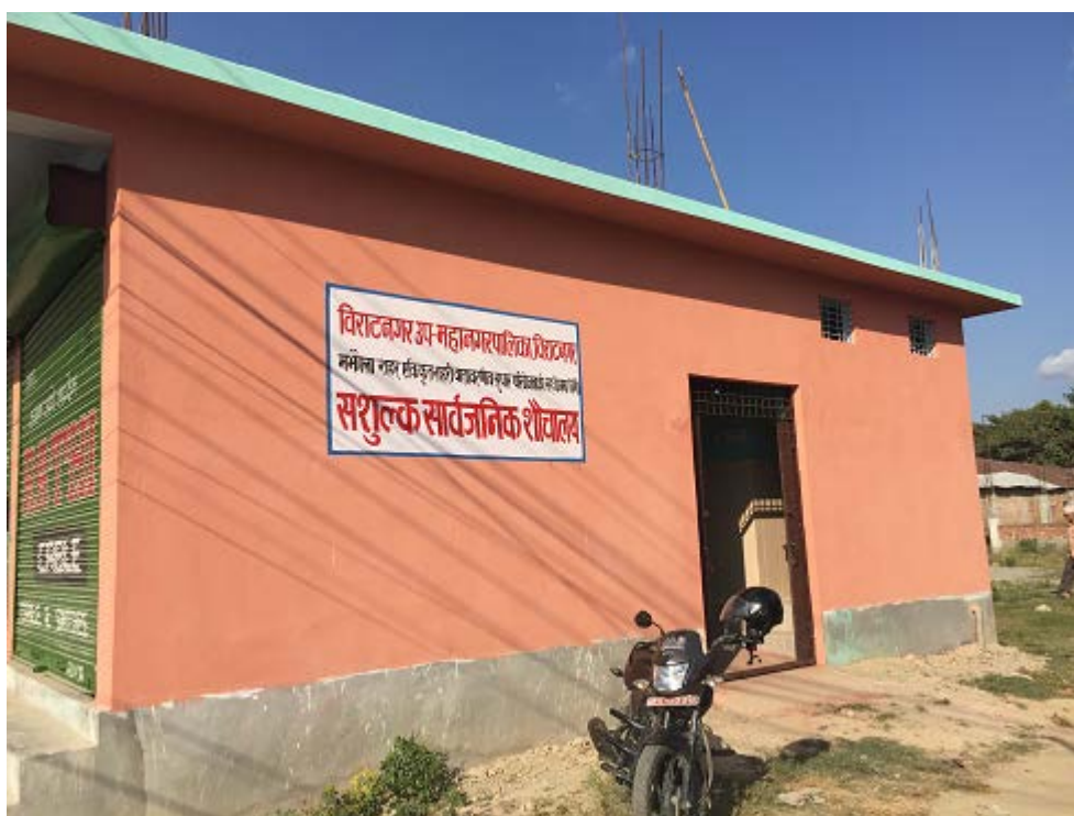
Figure 2. Public Toilet in Neta chowk ward no 1