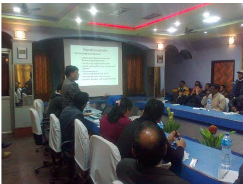
Figure 2. PM PIU Presenting before the hon'ble minister