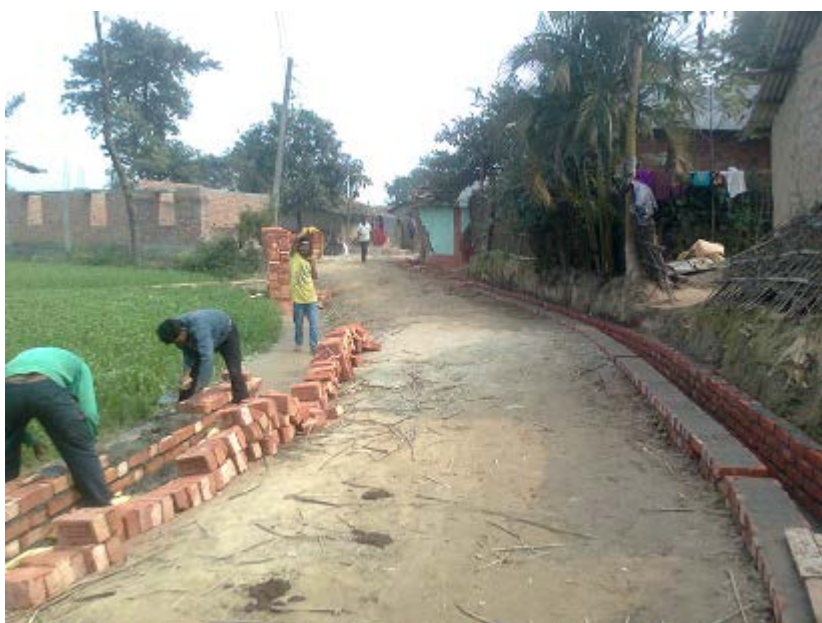
Figure 8. Kolhar road