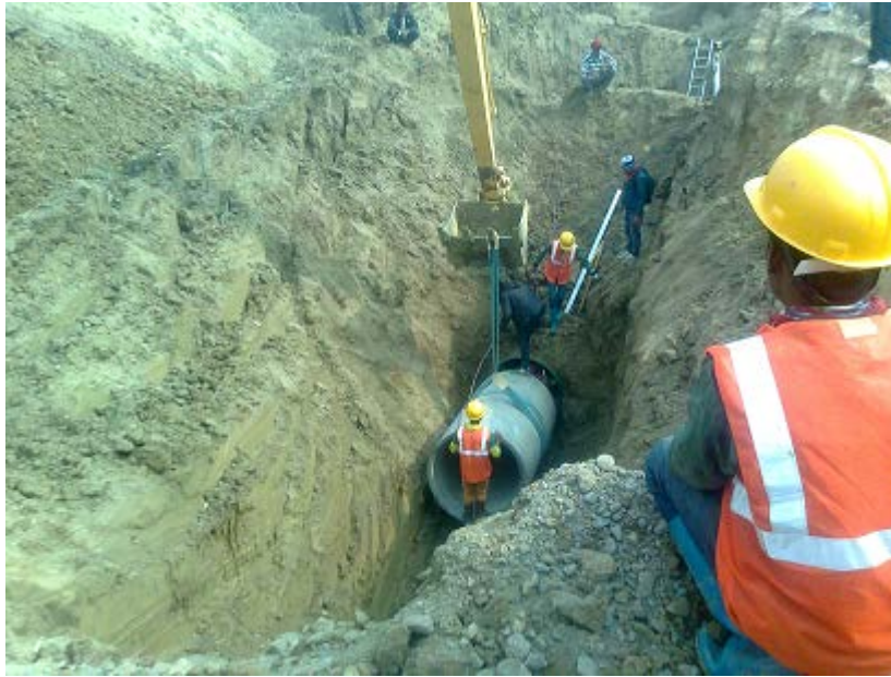
Figure 9. Sewer line being laid