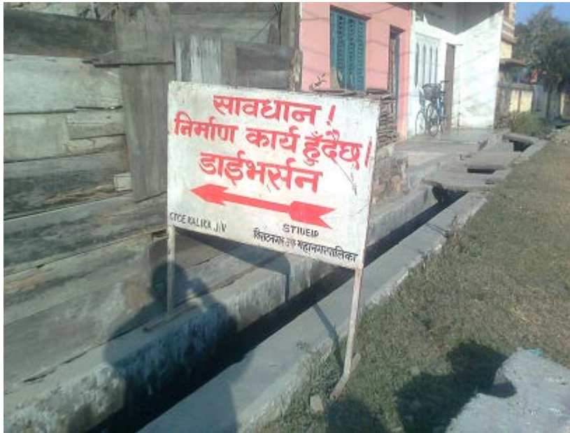
Figure 5. Project notice