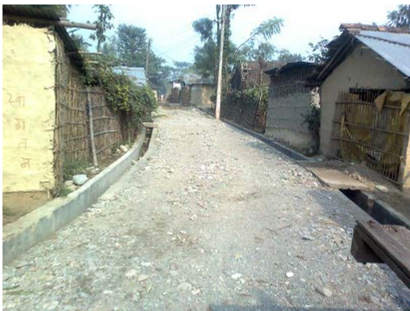
Figure 7. Kolhar road under construction