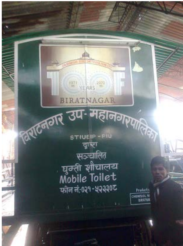
Figure 3. Mobile toilet ready to provide service