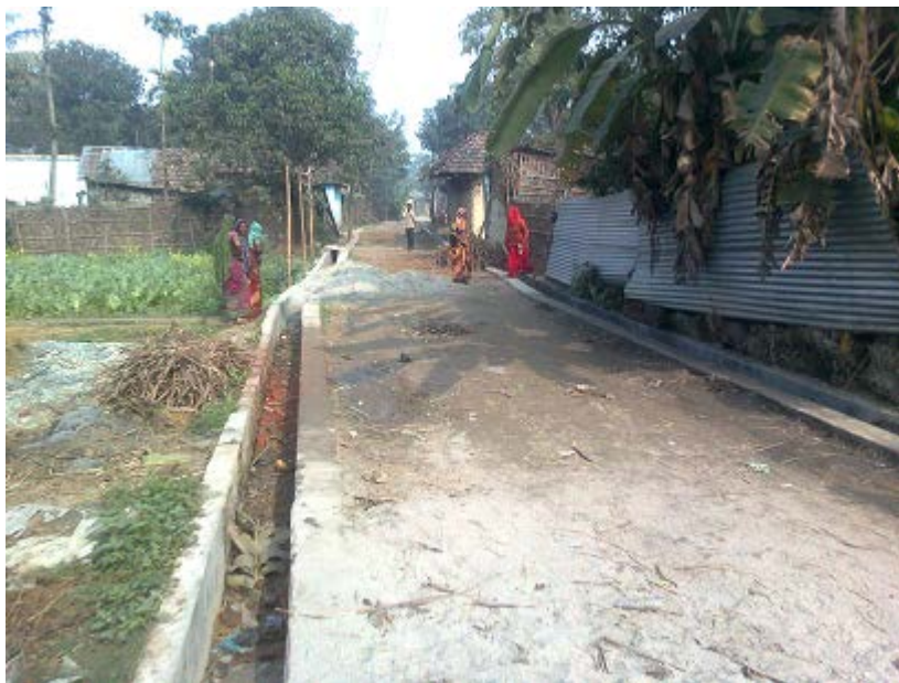
Figure 6. Lane improvement in Kolhar community in ward no 20