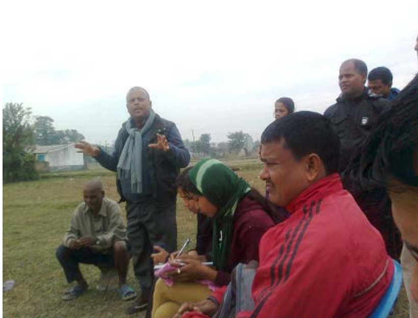
Figure 1. TLO leader addressing in an orientation program