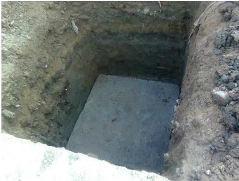
Figure 4. Household chamber for sewer connection under construction