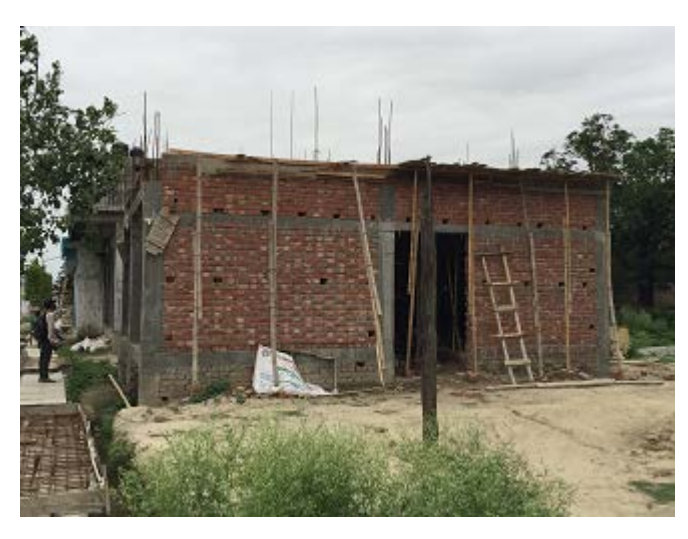
Figure 5. Public Toilet in ward no 1, Bishnu Maya Pustakalaya