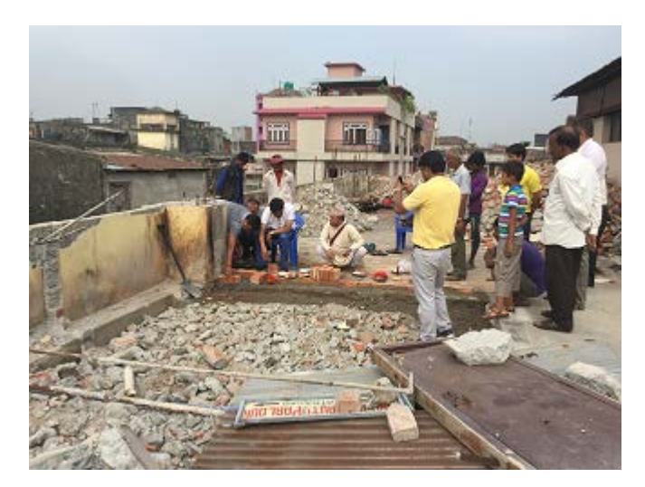
Figure 3. Stone laying of Public Toilet in Gudari C Block by EO BSMC