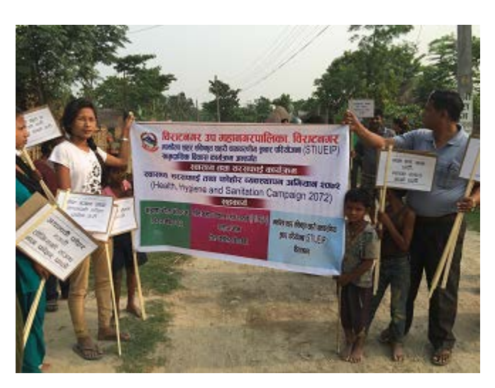
Figure 1. Health awareess campaign

2015 MAY RELEVANT PHOTOGRAPHS OF THE MONTH