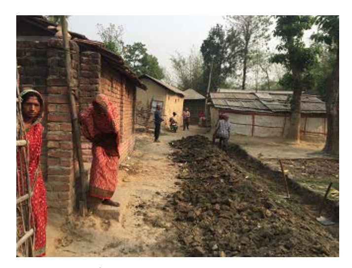
Figure 8. Eager for better road