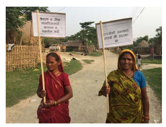
Figure 2. Glimpses of the health awareness campaign under RRR activities