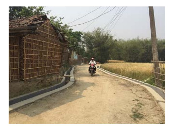
Figure 9. Improved lane