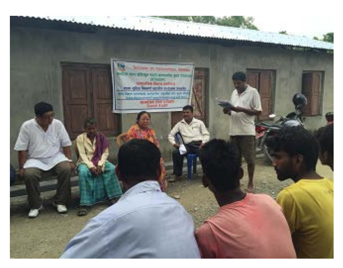
Figure 6. Glimpses of Social Audit in Chauthi Tole, wadr no 20